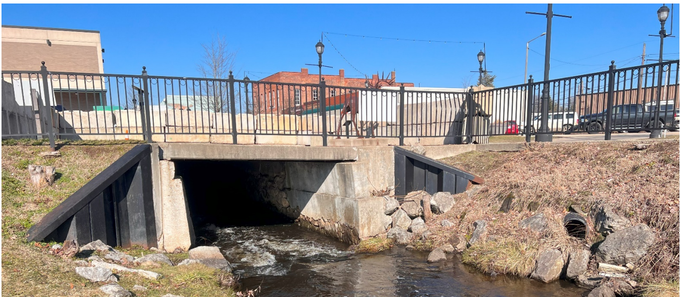
Figure 1: Image of failing culvert parallel to Days Avenue facing north (Buchanan, MI). Note: failure area inside culvert is approximately 10-20’ into the culvert.

Abonmarche has prepared a permit application, and the City has requested continued services. Per our discussions, Abonmarche will advance the design of the steel sheet pile walls, prepare an informal bid package, assist with bidding and award, and administer construction. The scope of work herein is intended to define the scope of work discussed.