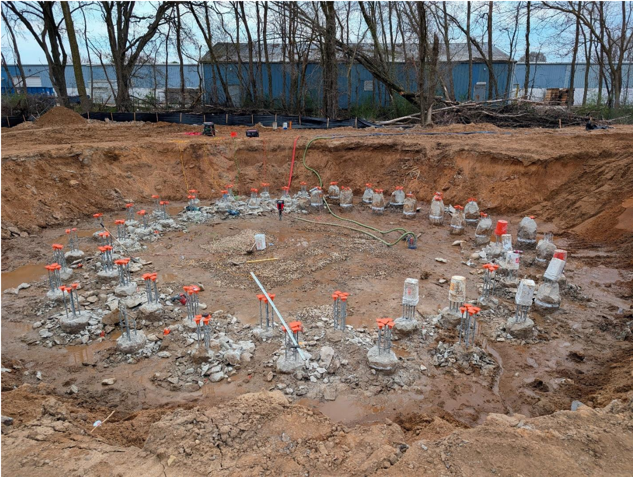
Water Tower foundation