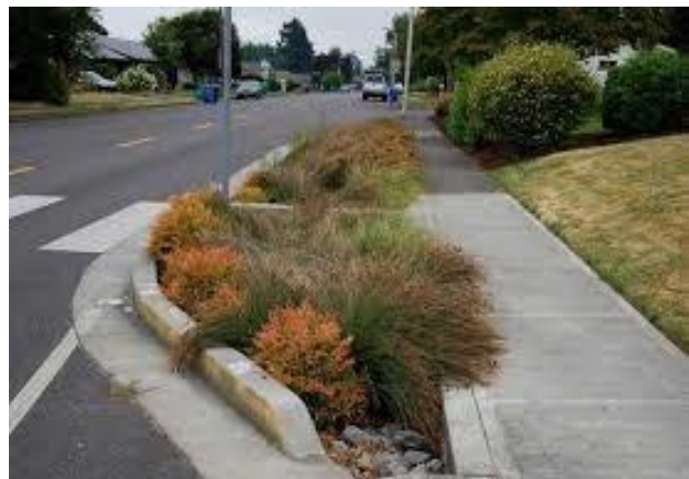
Sample Bioretention Basin Installed Along the Route