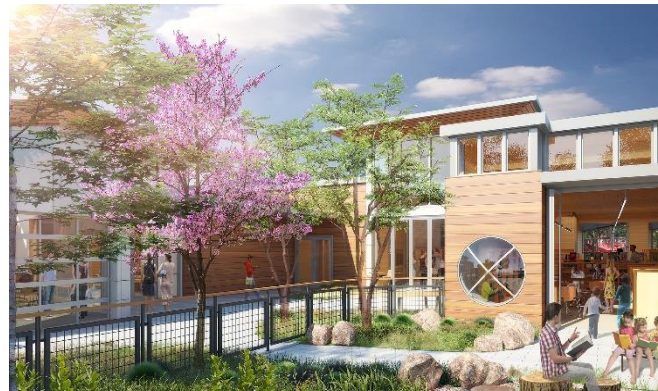
Rendering of Brisbane Library