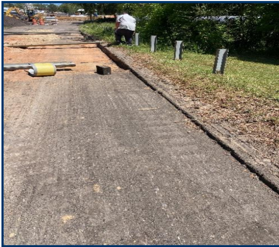
Resilient Stormwater Park Contractor removing guardrails on Moody Street.