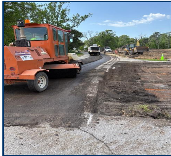
Resilient Stormwater Park Contractor milled up existing asphalt on Moody Street