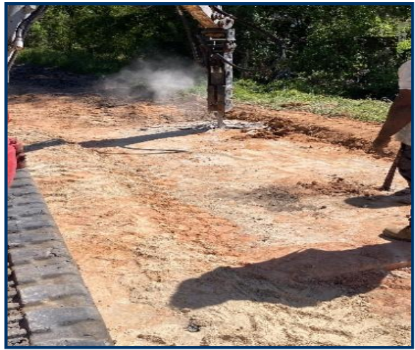
Resilient Stormwater Park Contractor demoing concrete pad on Moody Street.