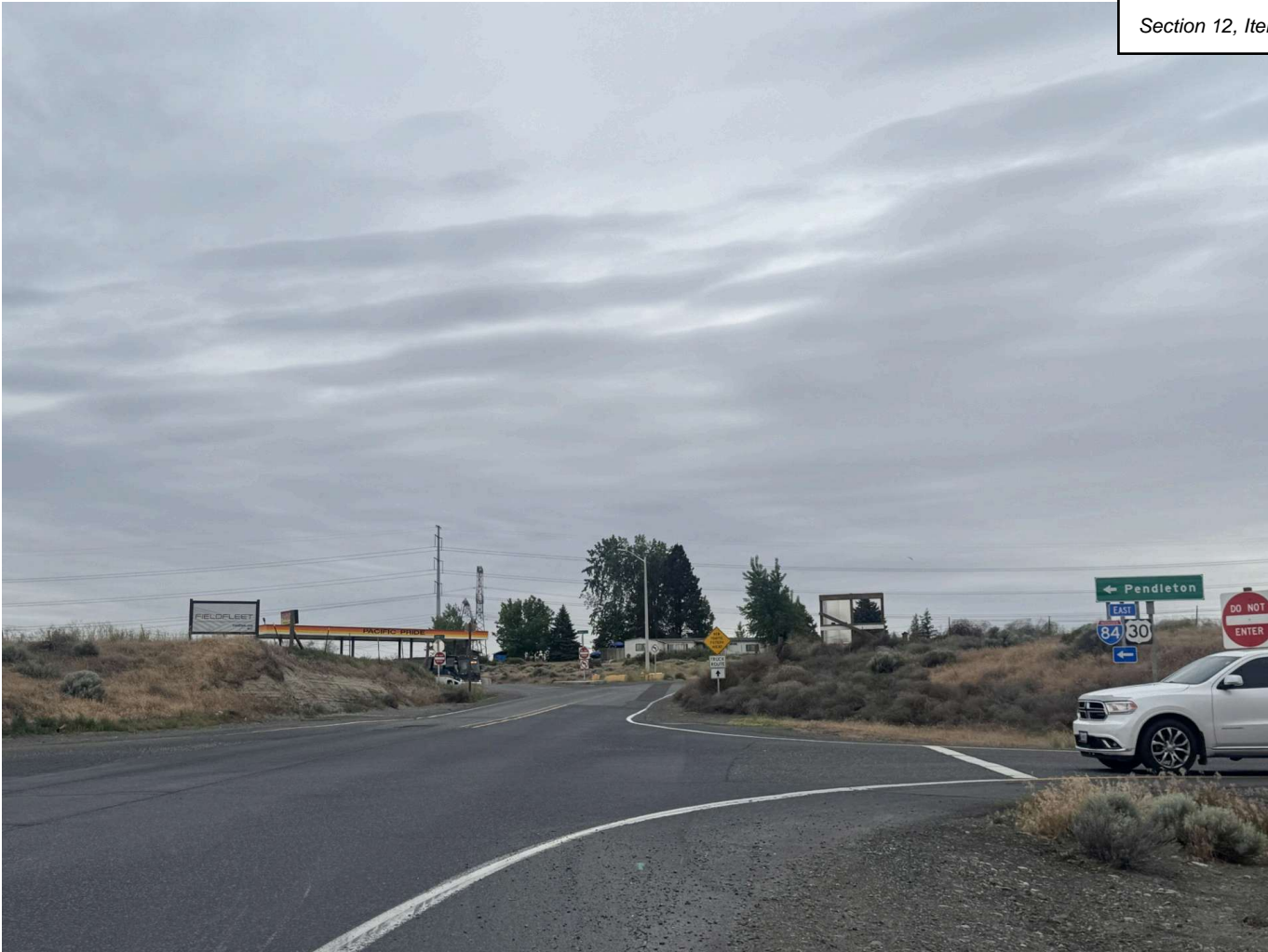
One taken down the other not?