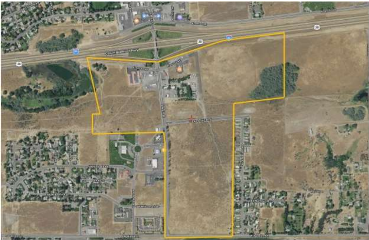
Boardman Central Urban Renewal Satellite Map 2017

https://satellites.pro/Boardman_map.Oregon_region.USA