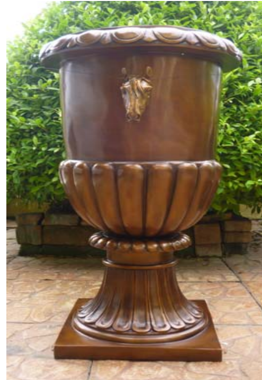
Bronze Themed Horse Urn - Planter DK 2555 BH | $1795 ea. / 16"L x 16"W x 30"H Other Animals or custom Available.