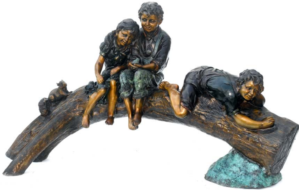
Bronze Boys & Girl Log Statue ASB 809 | $4995 ea. 70"L x 24"W x 39"H Bronze Boys & Girl Log Statue