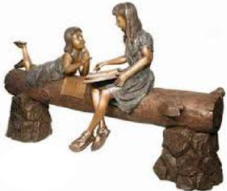
Bronze Kids on Log with Bird Cage Statues MPC B-959 | $5495 ea. 53"L x 17"W x 38"H Bronze Children Statues