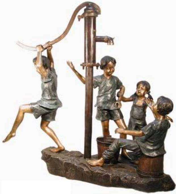
Bronze Kids at Pump Statue AF 52470 | $6495 ea. 65"L x 37"W x 69"H Bronze Kids at Pump Statues