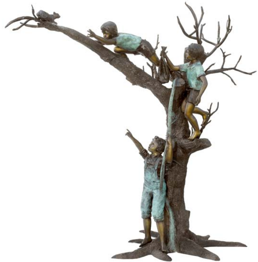
Bronze Kids in Tree & Squirrel Statue ASB 798 | $9995 ea. 92"L x 60"W x 99"H Bronze Kids in Tree & Squirrel Statues