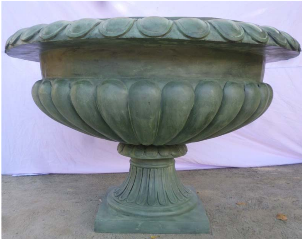
Maria Del Carmen Collection DK 2552 | $3495 ea. / 43"L x 43"W x 30"H Avail. Themed Horse, Deer, Etc.