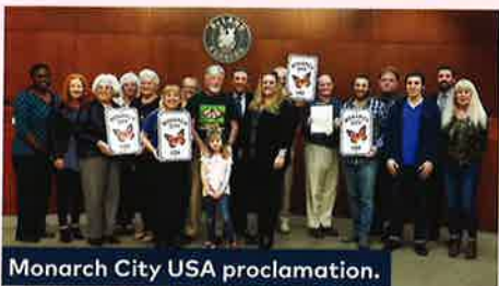
Monarch City USA proclamation.