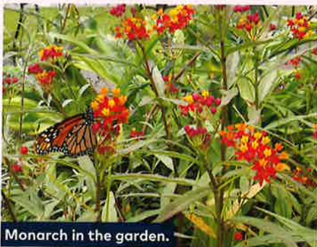
Monarch in the garden.