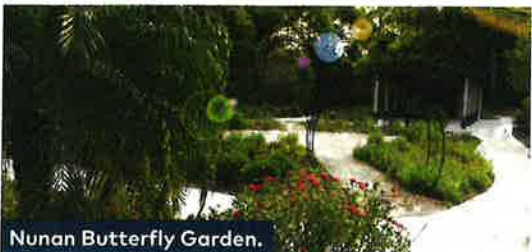
Nunan Butterfly Garden.