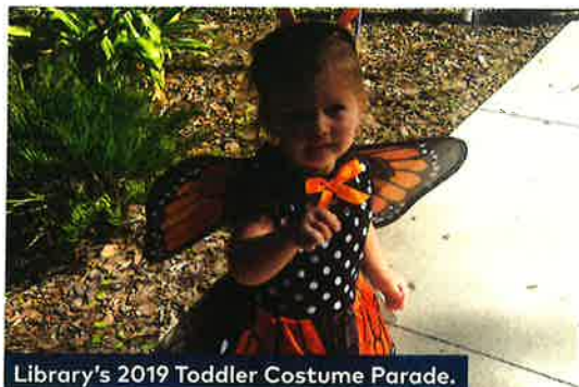
Library's 2019 Toddler Costume Parade.