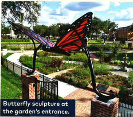
Butterfly sculpture at the garden's entrance.