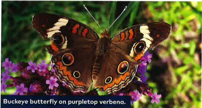
Buckeye butterfly on purpletop verben.

by Tia Silvasy UF/IFAS Extension Orange County