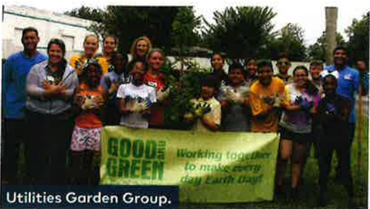
Utilities Garden Group.

Residents are encouraged to certify their garden through the National Wildlife Federation, which acknowledges them with a certificate. If residents attend one of the workshops or special events and show proof of certification, they receive a free yard sign as well as butterfly-friendly plants and seeds.