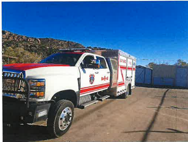
11/06/2025 Alliance Appraisals Inc 5078489522749440795.jpg