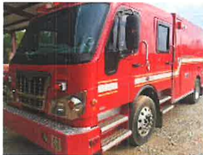
2009 Braun Spartan Furion Custom Res