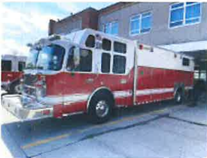
2009 Spartan Marion Walk-In Heavy Re:

Here are other options that meet your search criteria.