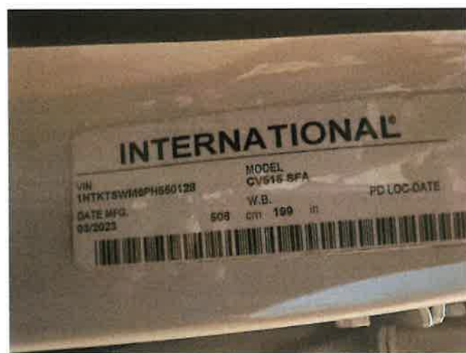
11/06/2025 Alliance Appraisals Inc 6656624563734462502.jpeg