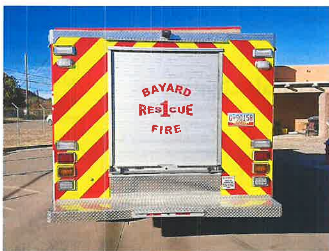
11/06/2025 Alliance Appraisals Inc 3366617540040503460.jpg