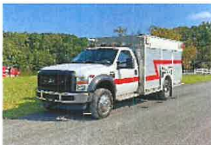
2009 KME Ford F-550 Light Rescue