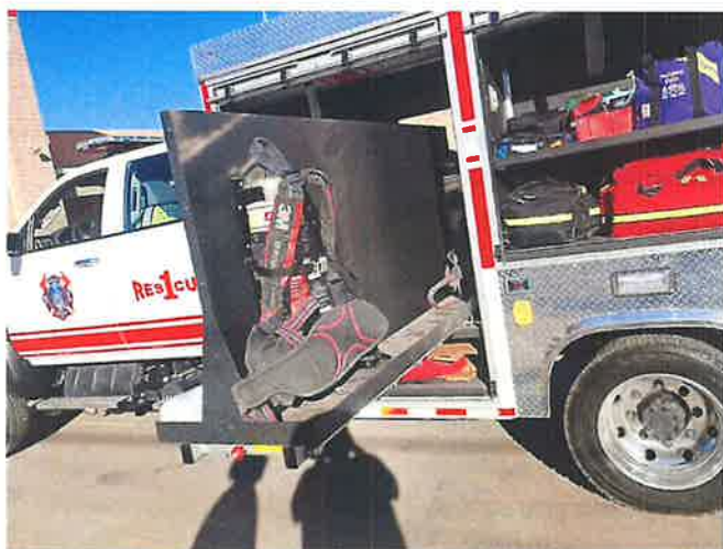
11/06/2025 Alliance Appraisals Inc 2967260828137543144.jpg