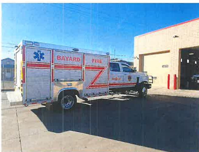
11/06/2025 Alliance Appraisals Inc 3511969665170935448.jpg