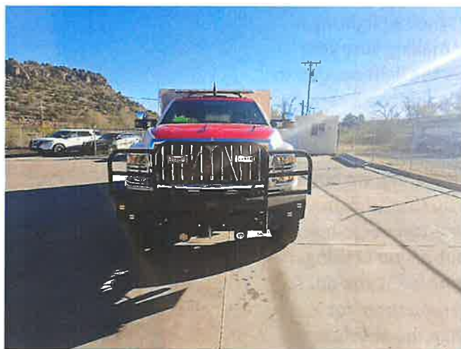
11/06/2025 Alliance Appraisals Inc 1908594936302988153.jpg