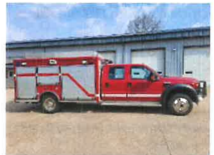
2009 Pierce Ford 4x4 Commercial Light