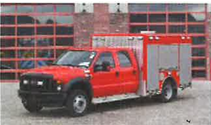
2009 Ford 4x4 Commercial Light Rescue