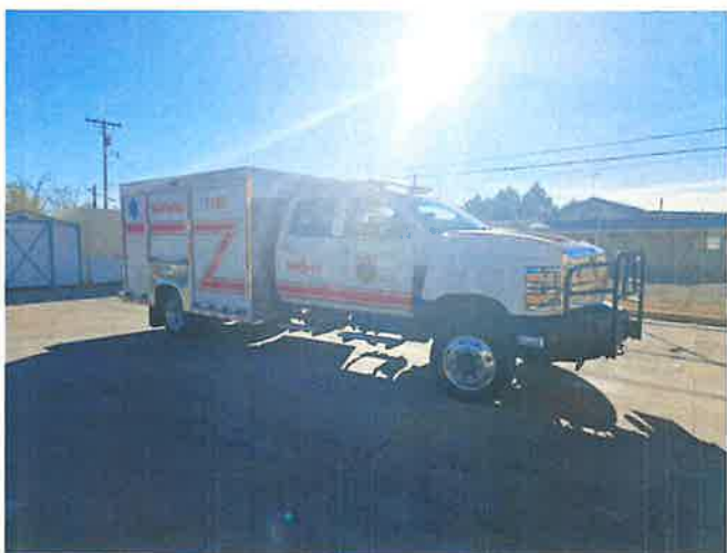
11/06/2025 Alliance Appraisals Inc 3421324442616221736.jpg