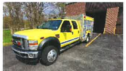
2009 KME Ford 4x4 Commercial Light R