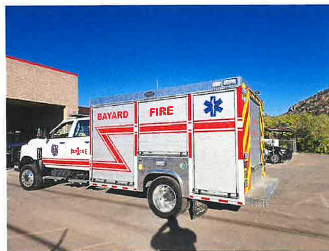
11/06/2025 Alliance Appraisals Inc 918248215300546239.jpg