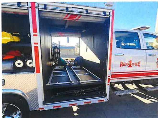
11/06/2025 Alliance Appraisals Inc 4891430880518801521.jpg