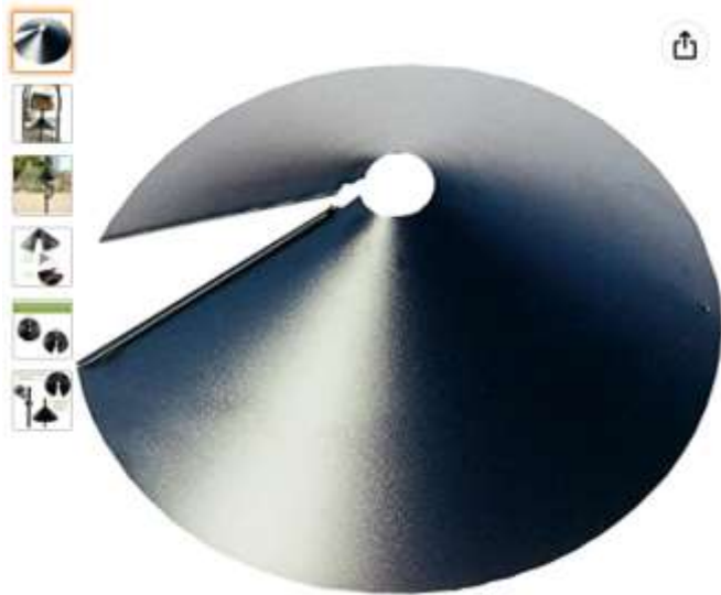
Baffle guard for mounting pole