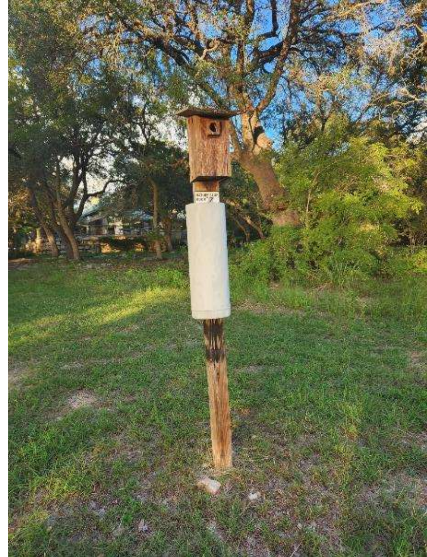
Stovepipe guard for mounting pole