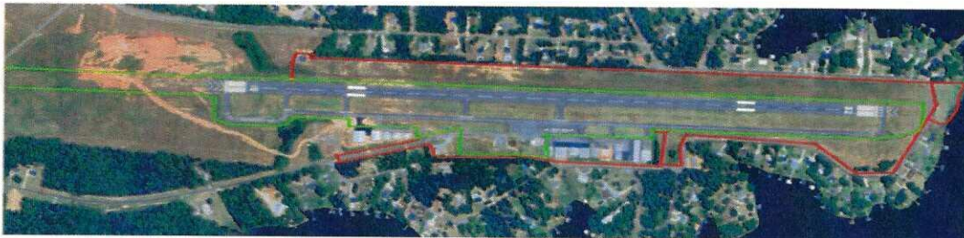
Current grass cutting area is the green line back to paved surfaces. Additional grass cutting area is the red line back to paved surfaces and along Airport Rd leading to the terminal. The steep slopes behind the hangers and buildings are excluded. All culvert and unreachable areas will be sprayed with weed killer.