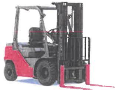
Photo may portray optional equipment not included in your quotation.