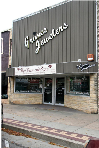
113 S. Summit Front/east facade. 11/14/2017. B. Spencer