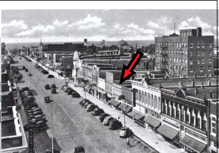
1940 Historic View. Images: A Pictorial History of Cowley County Vol. II (2001) scanned by Cowley Co. Historical Museum. Emphasis of arrow added.