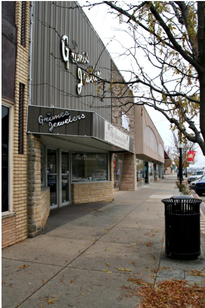
113 S. Summit. Storefront looking north. 11/14/2017. B. Spencer