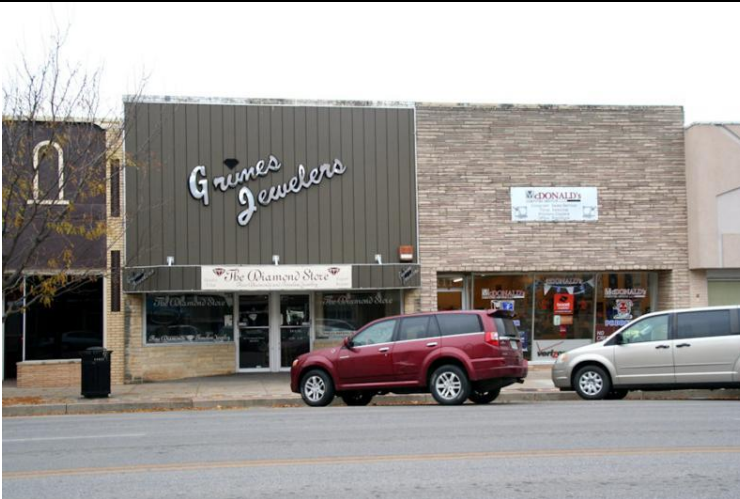
Front/east facade (113 on left). 11/14/2017. B. Spencer