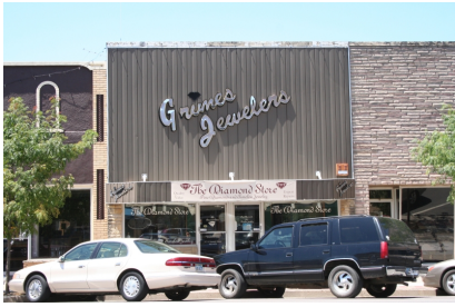
113 S Summit. Principal Elevation. 07/24/2009.