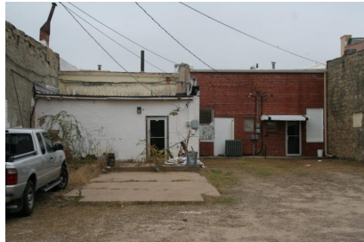
113 S. Summit XX 11/14/2017 B. Spencer