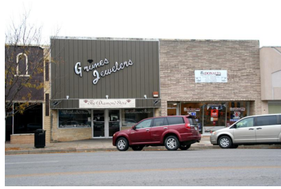
113 S. Summit. Front/east facade (113 on left). 11/14/2017. B. Spencer