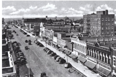
113 S. Summit. 1940 Historic View.