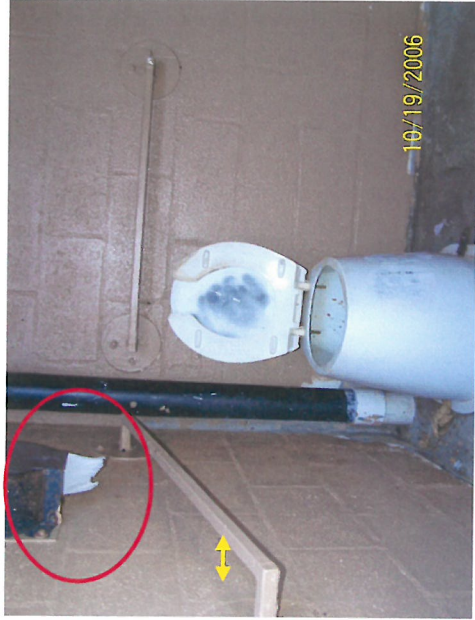
Restrooms have toilet paper dispensers mounted above side grab bars and 3" between bars and wall (yellow arrow).