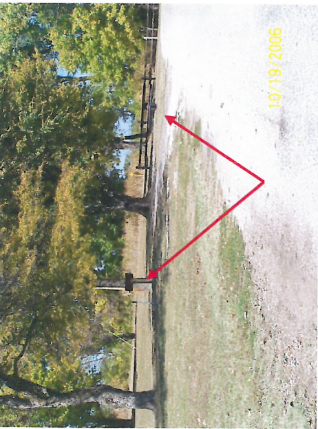
Amenities such as fixed picnic tables and BBQ grills are not on accessible routes.