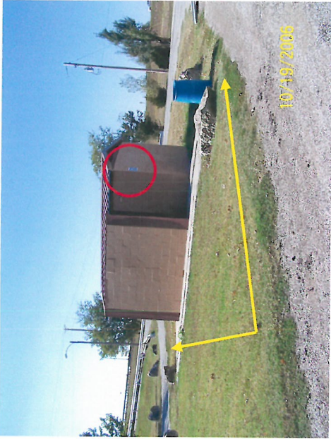
The restrooms are not on an accessible route. Signage is located off the route to the entrance.