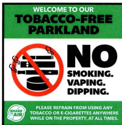
Decals - 8" x 8"