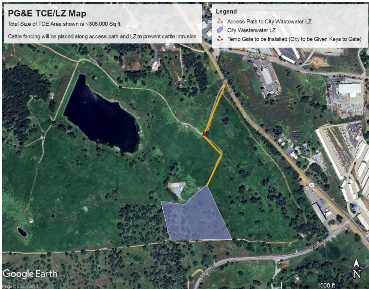
Exhibit A 2600 Hwy 49 - Sewage Disposal Site