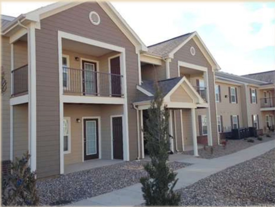
Dunes Apartments Seminole, TX