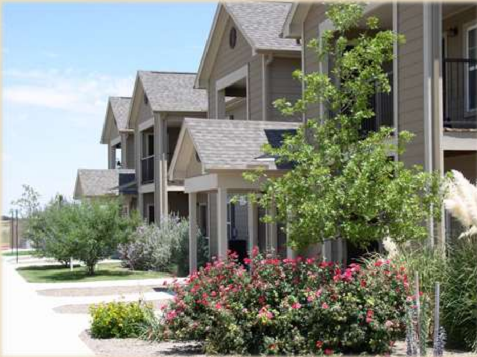
Valley Creek Ft. Stockton, TX