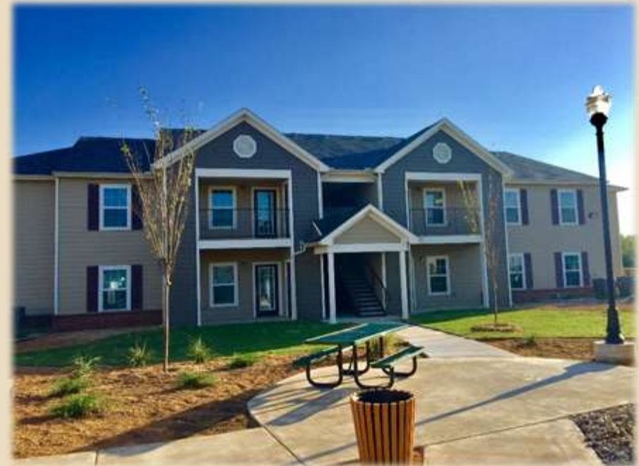
Riverstone Park Early, TX