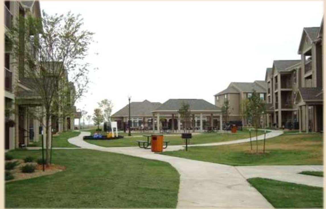
Stone Canyon Apartments Amarillo, Texas