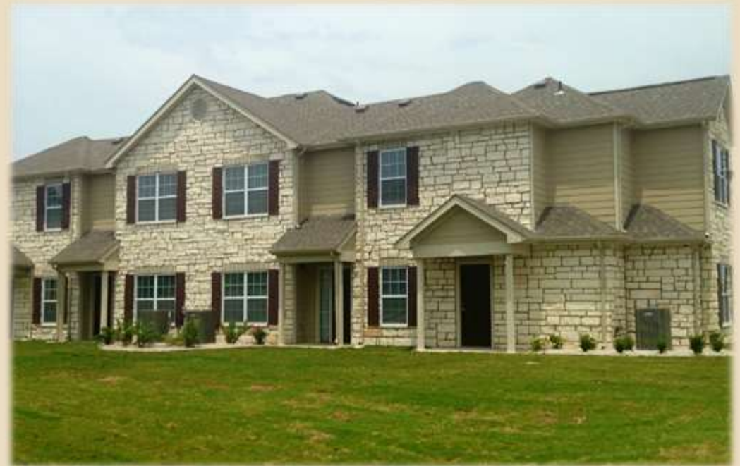
Riverstone Trails Sunnyvale, TX