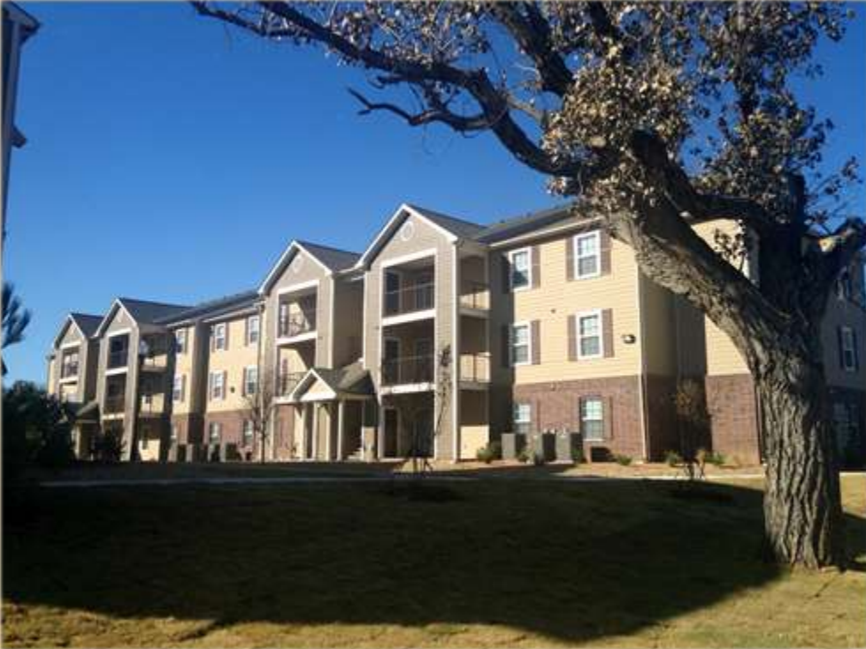
Winchester Arms Comanche, TX