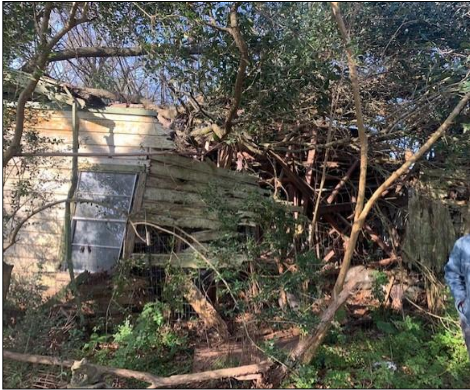
(Before demolition - from side view)